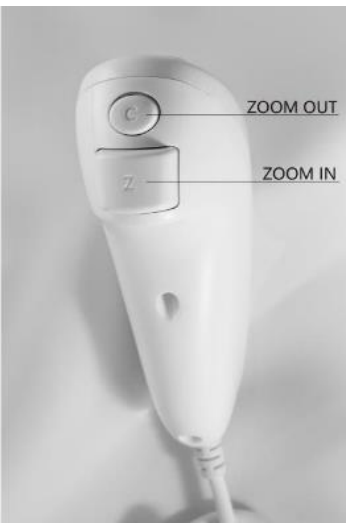
PT+z Controller™ - Standby and Joystick record